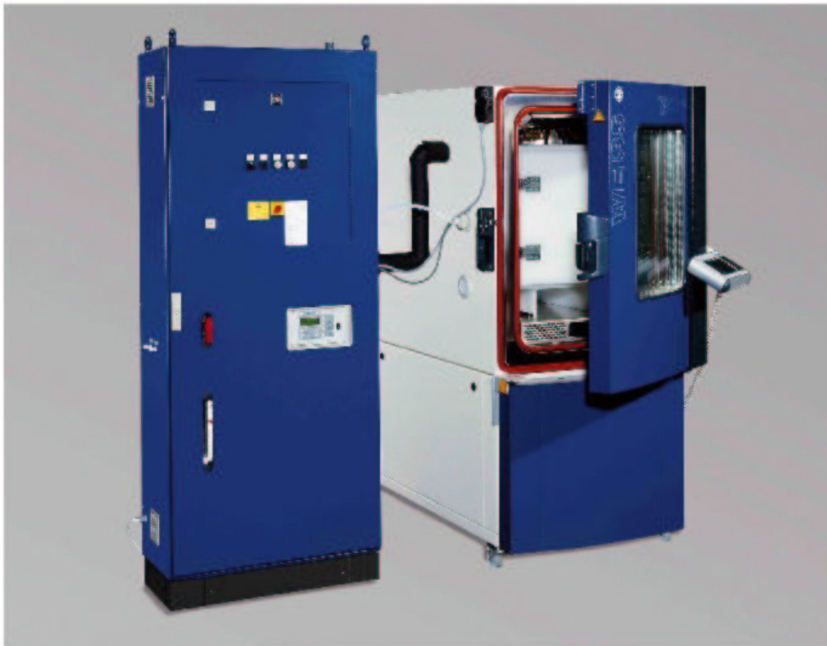
Type WK ... with BSB

Corrosive gasses (noxious gasses) in the atmosphere damage materials, components, appliances and buildings. Noxious gas climate tests in research, design and quality assurance are necessary to assess the suitability of materials for particular applications.